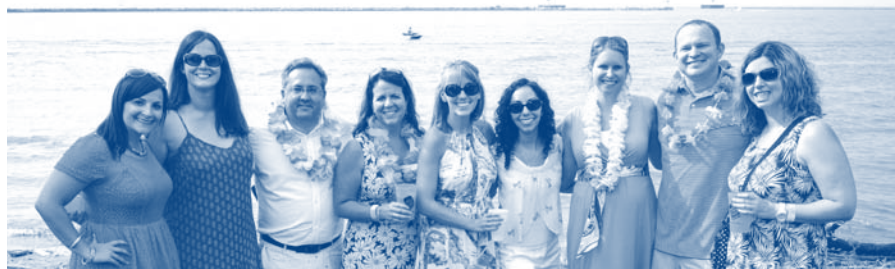
Current and former Associate Board Members at the Luau on the Lake

Visit www.sc4k.org to stay up-to-date on The Associate Board's activities or to get involved!