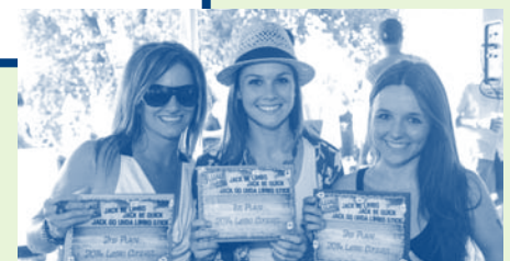
This year's top three Limbo Contest winners

The Luau on the Lake is a tremendous group effort and we thank everyone involved in making this our best year ever! Plans are already underway for the 10 th Annual Luau on the Lake which will be held in July 2015.